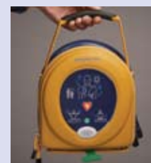
2.4 lbs. light.