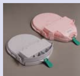
Pad-Pak™ and Pediatric-Pak™, with pre-attached electrodes

Low cost of ownership. Cartridge typically has a shelf-life of 3.5 years from date of manufacture, offering significant savings over other defibrillators that require separate battery and pad units.