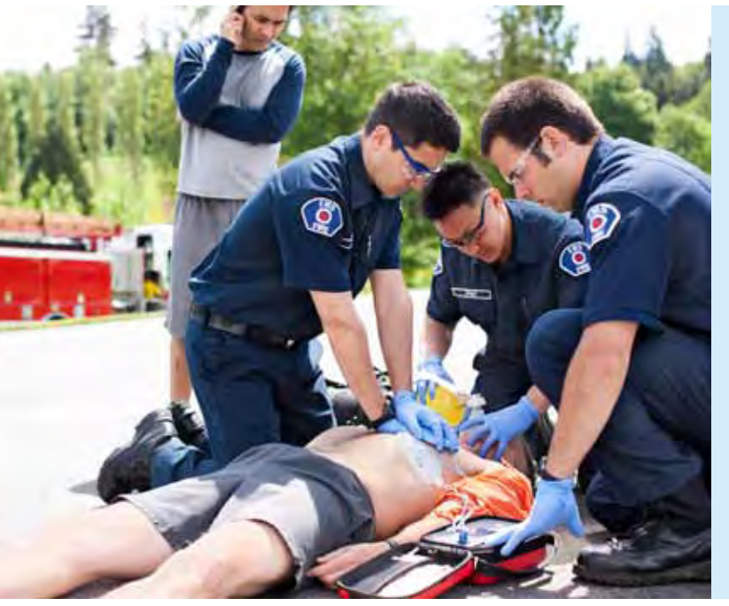
Philips Quick Shock technology reduces the time between hands-off and shock delivery to minimize CPR interruptions.